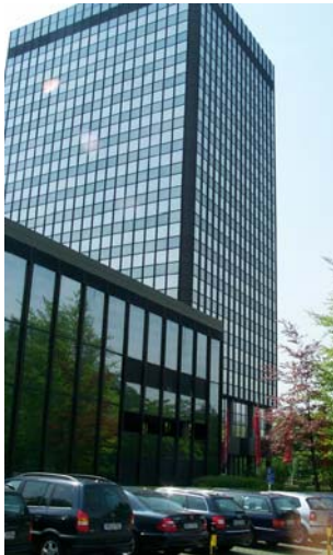
Fig. 1: Headquarters of the Knappschaft-Bahn-See in Bochum

One of the central points of the "Hartz Reform" of the German employment market was the regulation of part-time jobs: part-timers no longer have to obtain a certificate of exemption from the tax authorities and employers pay total social contributions at a fixed rate of 30 percent to a central body, the Deutsche Rentenversicherung Knappschaft-Bahn-See (German Pension Fund Mining-Rail-Sea = KBS). Some 1 800 employees receive notifications concerning part-timers; statements of contributions paid and employer contributions and forward the revenue to the social insurance agencies concerned as well as to the Bundeszentralamt für Steuern (Federal Central Office for Taxes).